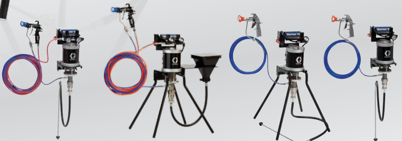
30:1 air-assist wall mount