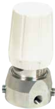
High Pressure Fluid Back Pressure Regulator Part No. 26A081