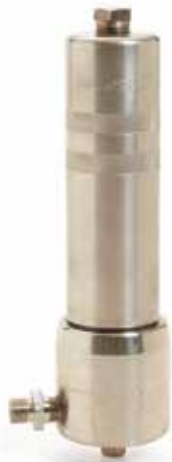
Stainless Steel High Pressure Filter Part No. 26A069