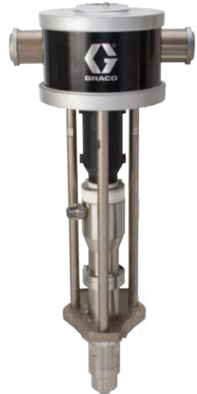
Merkur Bellows Pump

All written and visual data contained in this document are based on the latest product information available at the time of publication. Graco reserves the right to make changes at any time without notice.