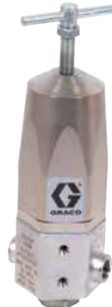
High Pressure Regulator Part No. 26A085