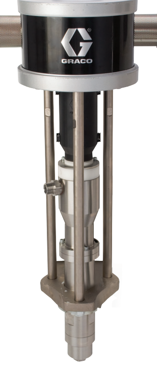
Merkur Bellows Pump

All written and visual data contained in this document are based on the latest product information available at the time of publication. Graco reserves the right to make changes at any time without notice.