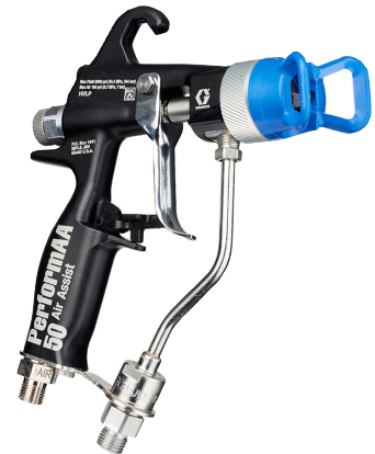
PerformAA 50 Air Assist gun sprays at 5,000 psi for peak performance at high pressures.