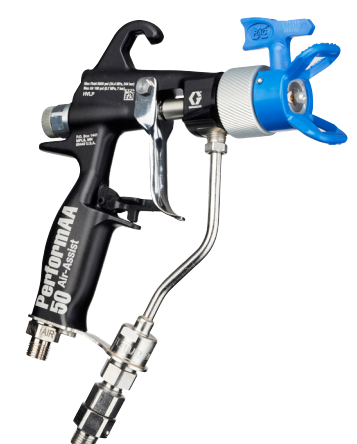
PerformAA 50 RAC® Air Assist gun sprays with a Reverse-A-Clean® tip at 5,000 psi for high pressure applications.