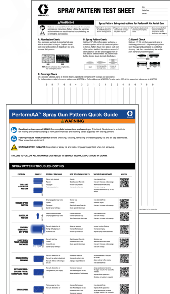
Spray Pattern Guide