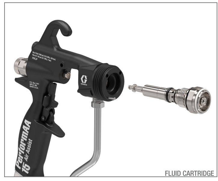
Fluid cartridge is made of durable stainless steel and has a reversible seat for easy assembly.