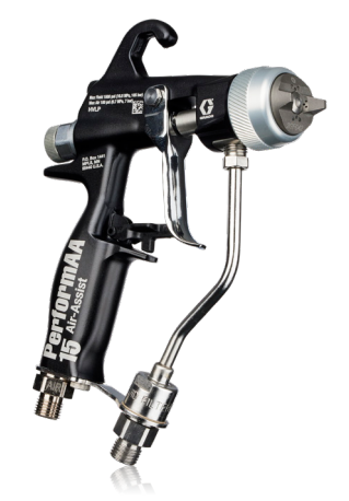
PerformAA 15 Air Assist gun sprays at 1,500 psi for optimal performance at low and medium pressures.