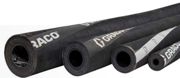
FDA Approved Hoses.