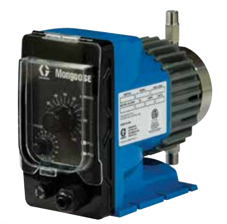
Mongoose<sup>™</sup> with standard check valves