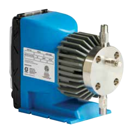
Mongoose™ Graco Check Valve on SST models