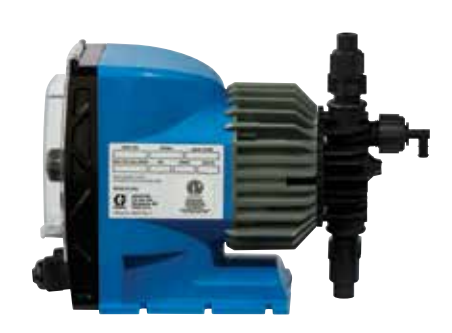
Mongoose™ PVDF Head