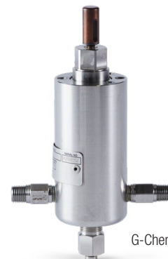
G-Chem Fluid Head

Call 866-552-1868 today for product information or to request a demonstration.