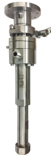
Progressive Cavity Pump

*Exact configuration will vary and depend on factors such as rate of output, length and size of hoses, bead size desired, and container sizes.