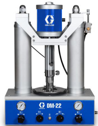
DynaMite 22 Supply System *Replacement for 25C843