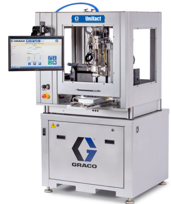
UniXact C300 Automation Table