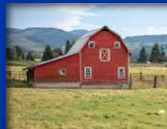
REMOTE LOCATIONS & MORE!