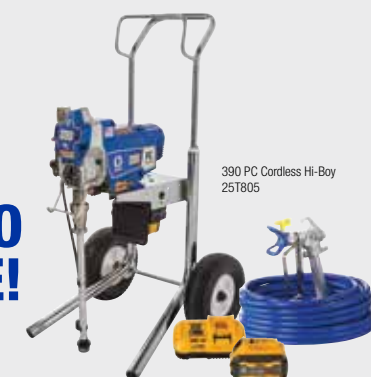
390 PC Cordless Hi-Boy 25T805