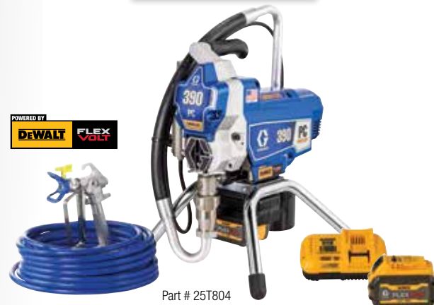
Part # 25T804