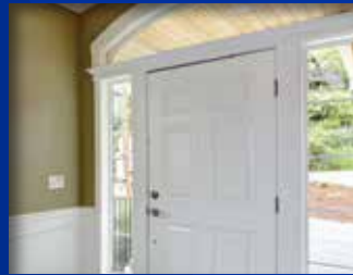
DOORS & TRIM