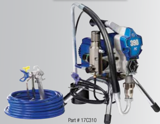
Part # 17C310