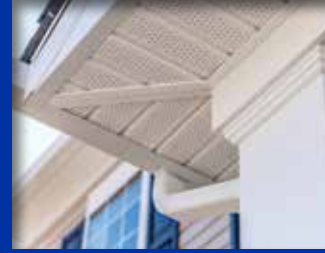
SOFFITS & FACIA