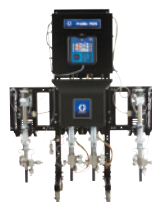
PD2K Auto Precision flow rate control to ensure even film thickness