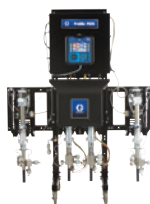
ProMix PD2K Auto Precision flow rate control to ensure even film thickness