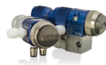
AirPro EFX Superior atomization and precision spray pattern control