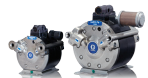
Endura-Flo Long lasting durable pump for a reliable fluid supply