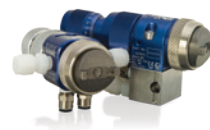
AirPro EFX Superior atomization and precision spray pattern control