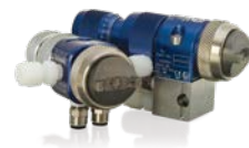
AirPro EFX Superior atomization and precision spray pattern control