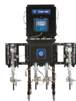
PD2K Auto Precision flow rate control to ensure even film thickness