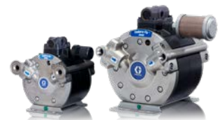
Endura-Flo Long lasting durable pump for a reliable fluid supply